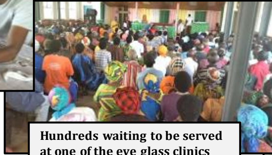
Hundreds waiting to be served at one of the eye glass clinics