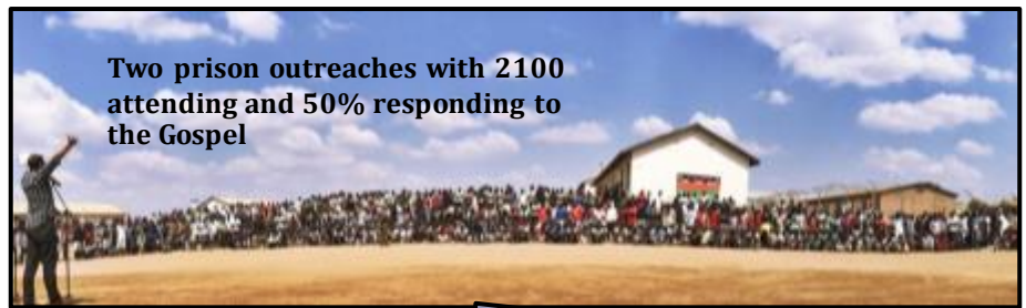
Two prison outreaches with 2100 attending and 50% responding to the Gospel