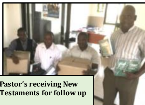
Pastor's receiving New Testaments for follow up