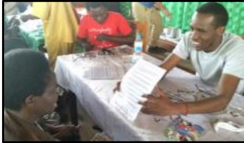
Eye Glass Clinics served 2400 people in eight villages over four days