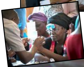
Eye glass & Medical Clinics – more than 10,000 served – 678 decisions