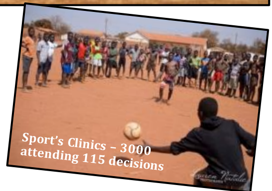
Sport's Clinics – 3000 attending 115 decisions